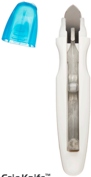
BVM Wedge included